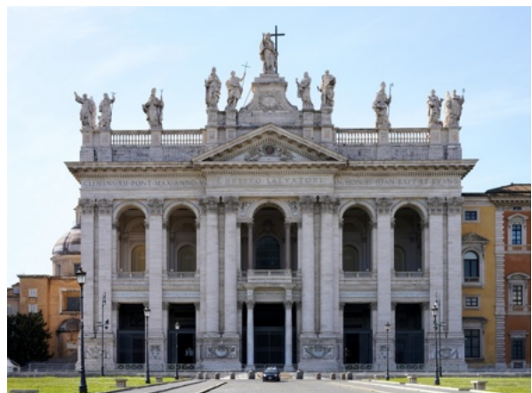
St. John Lateran is the cathedral of the Diocese of Rome.

Each November 9 the Church also celebrates the Feast of the Dedication of St. John Lateran, the cathedral of the Diocese of Rome. It's one of the four papal basilicas of Rome. This year's