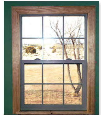
The finished product!