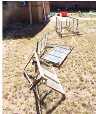
The original 1950s era windows didn't want to come out.